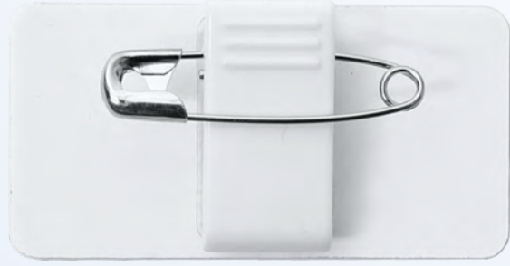
Pin and Clip