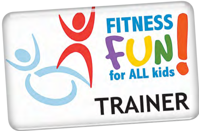
EB50 80 x 50mm